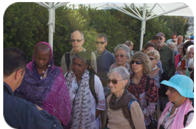
October 2014 - 1000th delegate!