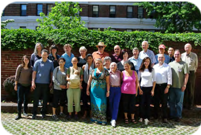
May 2014 - 50th delegation!

With our May and Olive Harvest delegations, Interfaith Peace-Builders has sent 50 delegations and 1000 delegates to Palestine/Israel - seeding the growing Palestine solidarity movement with engaged and knowledgeable activists, organizers and media-makers.